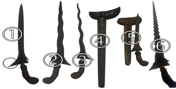
Figure 3. Artifacts that mark the relation of Islamic civilization and Javanese keris